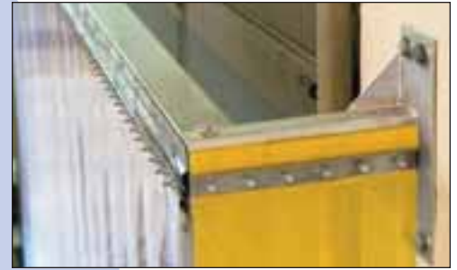
Heavy-Duty Stand-Off-Mount Bracket For Doors Over 12' Wide

StripGard PVC strip doors and curtains are an economical solution for protecting people and goods from adverse environmental conditions. They're inexpensive, easy to install, and can save hundreds of dollars in energy costs every year. They provide thermal insulation, noise reduction, and physical or visual barriers.