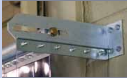
Light-Duty Stand-Off-Mount Bracket Optional