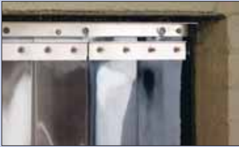
Universal-Mount Bracket Under or Flat Mount